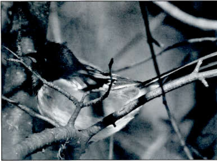
Spotted Towhee. Wheaton, DuPage County. 25 December 2003.