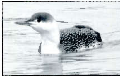
Red-throated Loon at Winthrop Harbor, Lake County. 9 February 2009.

Feb> (TJD); 2, Whalon L FP (Will Co), 14 Dec (UWG); 2, Mazonia-Braidwd, 5 Dec (JBH); 2, Rome (Peoria Co), 17 Dec (MJB); Wauk., 14 Feb> (MJB, AFS, m.ob.); Chi, 6 Dec (CAT, TLK); Nauvoo (Hancock Co), 30 Dec (UWG); Urb., 28 Feb (DLT).