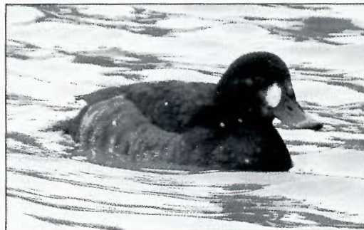
Female Greater Scaup. Montrose, Cook County. 22 December 2009.