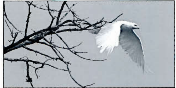
Albino Red-tailed Hawk at McKinley Park, Will County. 25 February 2009.

MC: 577, Miss. R (Henderson & Hancock Cos), 24 Jan (CAT); 320 (230 ad., 55 imm., 35 others), Miss. R (Adams Co), 27 Feb (AGD); 178, Rock Island & Whiteside Cos, 22 Feb (UWG); 135, L&D #13 (Whiteside Co), 1 Feb (EWW); 80, Miss. R (Madison Co), 17 Jan (DMK, MSS); 60, HL, 17 Dec (DMK). Others : 162 (103 ad., 33 imm., 26 others), Mercer Co, 23 Dec (TM, WZ, m.ob.); 116, Illinois R (La Salle Co), 8 Feb (GAW, JHP); 108, Putnam & Bureau Cos, 20 Feb (DJS); 107 (46 ad., 61 imm.), Chau, 13 Feb (RGB, SNB); 74, Brown, Morgan, Pike, Scott Cos, 16 Dec (TWd, SDB, m.ob.); 43 (26 ad, 17 imm), Lost Mound NWR (Jo Daviess Co), 19 Dec (fide DGW); 41 (18 ad., 6 imm., 17 others), Whiteside & Lee Cos, 3 Jan (AT, ET, m.ob.); 30, Carl.L, 17 Jan (DMK, MSS); 17 (3 ad., 14 imm.), Vandalia (Fayette Co), 20 Feb (MAH); 17 (10 ad., 7 imm.), Monroe Co, 11 Feb (CCD, PPD); 15 (1 ad., 14 imm.), Rend L, 8 Dec (KAM); 10, Grundy Co, 28 Feb (CAT); 9 (3 ad., 6 imm.), Pecatonica R (Stephenson & Winnebago Cos), 28 Feb (DTW); 9 (2 ad., 7 imm.), Crab Or., 21 Dec (KAM, CAT, TLK); 9 (3 ad, 6 imm), Horseshoe Lake FWA (Alexander Co), 28 Dec (SDB, PM); 8 (5 ad., 3 imm.),