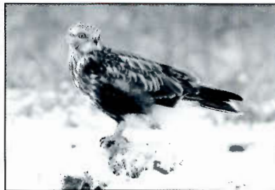
Rough-legged Hawk finishing feeding on a vole, Springbrook Prairie Forest Preserve, DuPage County. 7 January 2009.

(TJD); 2, Horseshoe Lake FWA (Alexander Co), 28 Dec (SDB, PM). Many additional reports of singles, primarily in n. half of IL.