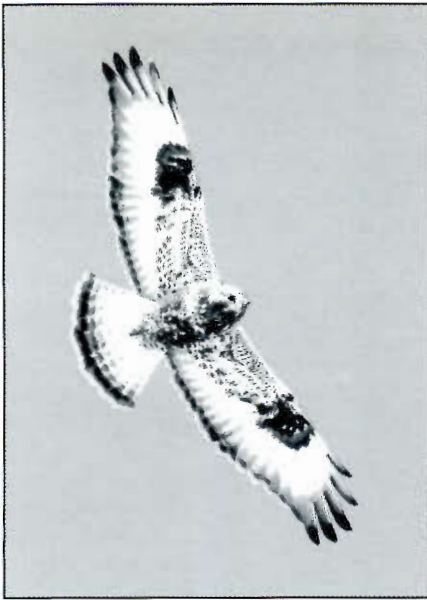
Rough-legged Hawk at Margaret Guzy Pothole Wetlands, Shelby County. 1 February 2009.