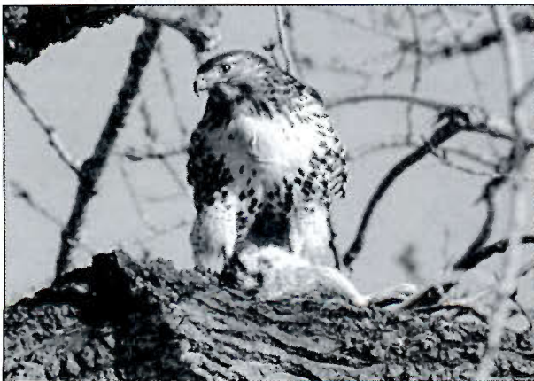
Red-tailed Hawk with cottontail rabbit prey at Montrose Harbor, Cook County. 25 January 2005.

imm., Urbana, 15 Dec & 16 Feb (EC); imm., Sand Rdg, 29 Dec & 27 Jan (AS, DFS); imm., Meredosia (Morgan Co), 14 Dec (SDB, MW, PW, HDB); imm., Mundelein (Lake Co) visiting suburban backyard daily, mid-Nov- 28 Feb (SDB,SD).