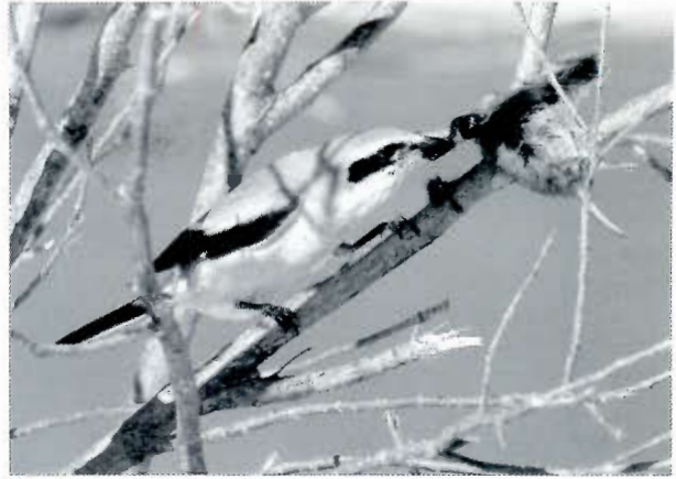
Northern Shrike with vole. Northerly Island, Cook County. above, 5 February 2011.