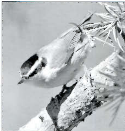
Red-breasted Nuthatch at Plum Creek Forest Preserve, Cook County. 25 January 2006.

MC: 214, QC, 18 Dec (KJM, m.ob.); 177, Rock Island Co, 4 Jan (BLB, m.ob.); 130, Mercer Co, 28 Dec (TM, m.ob.); 57, Kane Co, 17 Dec (EES); 54, Lake Forest (Lake Co), 26 Dec (GAW); 30,