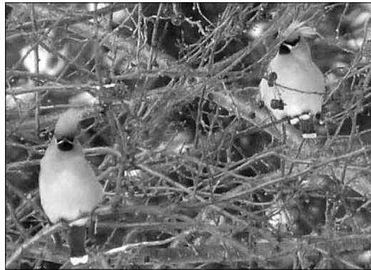
Bohemian Waxwings. North Point Marina, Lake County. 2 February, 2013.