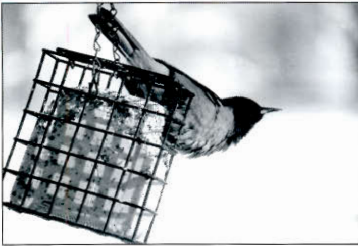
A juvenile male Scott's Oriole visited a suet feeder at Toulon, Stark County, in middle January 2000 and remained through part of February.