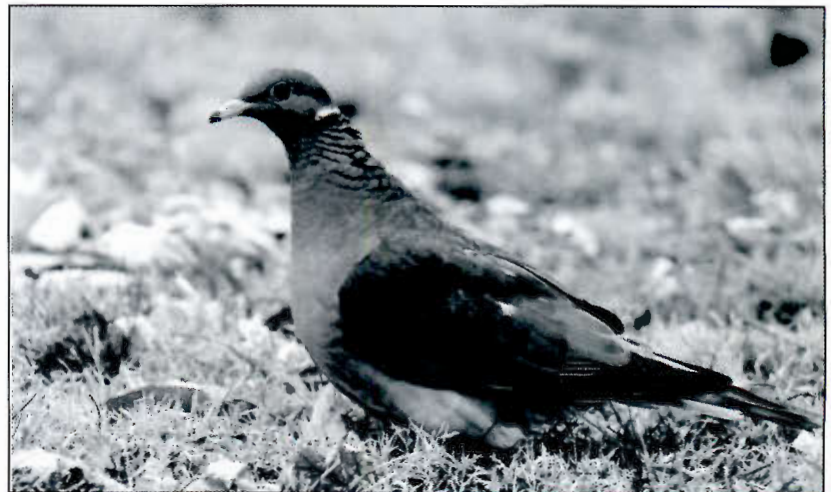
This Band-tailed Pigeon was discovered at a bird-feeding station in Springfield, Sangamon County.

at a feeder in Gurnee, Lake County in April 2000; and a Gray-crowned Rosy-Finch appearing for several days in a yard in University Park in Will County in November 1990. Who said feeder watching is dull! Hummingbirds, woodpeckers (the one and only Williamson's Sapsucker ever to appear in Illinois was present for several days in a Chicago backyard in April of 1985),