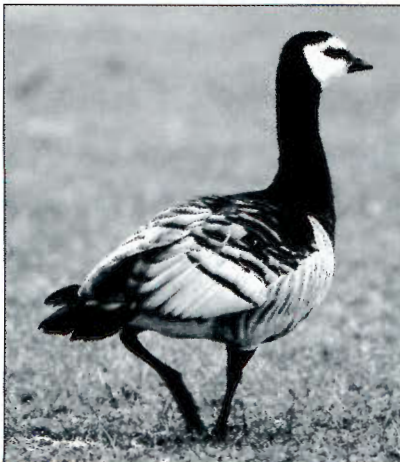
Barnacle Goose. North Island Park, Wilmington, Will County. 13 December 2009.