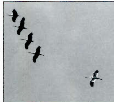
Whooping Crane with flock of Sandhill Cranes. Chicago, Cook County. 4 December 2009.