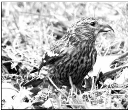
Immature White-winged Crossbill. Allerton Park, Monticello, Piatt County. 4 November 2012.

Counties in which the Red Crossbill was found in the 2012/2013 winter season.