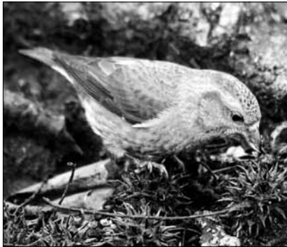
Female Red Crossbill. Eastern Illinois University, Coles County. 26 February 2013.

MC: 70 (~50 Type 2, ~20 Type 3) & 4, SRSF, 9 Dec & 9 Feb (*EWW & TAM:ph, vr resp); 15 (feeding on red & white pine cones), Lakewood FP (Lake Co), 26 Jan (SDB, BJS); 13, Urbana (Woodlawn Cem), 26 Jan (SRr); 12, LowdMil, 24 Dec (*ASA, LGt); 11, Spfld (Oak Ridge Cem), 24 Dec (HDB); 7, Rckfd, 26 Dec (SOi, POi). Others: Carle Pk (Urbana, Champaign Co) (9), 25 Dec (GSL); MArb (6), 29 Dec (MW); Hillside (Queen of Heaven Cem, Cook Co) (4), 27 Jan (DFS); Charleston (EIU Campus, Coles Co) (3♂, ♀ feeding on hemlocks & sweet gum seeds), 4-10 Feb (TZ, RB et al.), but 5 (feeding on sweet gum seeds) there 25-28 Feb (TDF:ph, MJB); Spring Valley NC (Schaumburg, Cook Co) (3+), 25 Feb (SAC); Rckfd (Greenwood Cem) (2♂), 3 Feb (DTW); Lyons Wds F.P. (Lake Co) (♀ & 1), 1 Dec & 17 Feb (AFS & JSS resp); Mount Carroll (Carroll Co) (2; 1♂), 2 Feb (SDB, DBJ); Chi (Douglas Pk) (2), 16 Dec (AG, EG); Putnam Co CA (2), 4 Jan (MJB); Galesburg (Knox Co) (2 & ♀), 28 Jan (19 Feb resp(DJM); Forestry (2♀; Type 2 feeding in European larch), 2 Dec (TAM); White Pines SP (Ogle Co), 15-16 Dec (DTW, EWW); CBG, 26 Jan (MH); LRSHNC (♂), 9 Feb (JHt:ph); Chi (Rosehill Cem) (♂), 26 (MDn); Brown , 9 Dec (EWW).