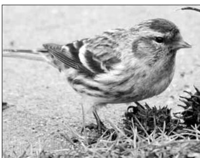
Common Redpoll. Eastern Illinois University, Coles County. 26 February 2013.