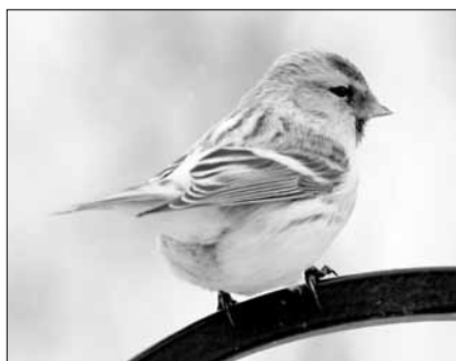
Hoary Redpoll. Chicago Botanic Garden, Cook County. 31 December 2012.