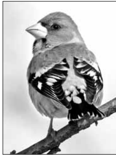
Evening Grosbeak. Rosehill Cemetery, Chicago, Cook County. 17 February 2013.