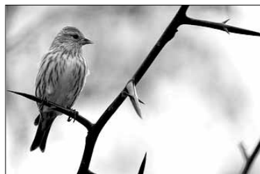
Pine Siskin. Allerton Park, Monticello, Piatt County. 2 December 2012.

(FRH). Others: e.Knox (161), 14 Dec (fide DJM m.ob.); Fulton & McDonough (131), 1 Jan (KJM, DJA); Henry (75), 4 Jan (KJM); Lee & Whiteside (67), 24 Dec (KJM, DJA, m.ob.); QC (61), 16 Dec (BLB, CB); Sugar Grove NC (Funks Grove, McLean Co) (50 & 40), 1 Dec & 9 Feb (DB:ph & BM:ph resp); Emiquon (50), 1-30 Dec (PB, NS, Ept); Pike (50), 17 Feb (JHD); Golden Eagle (Calhoun Co) (40), 17 Feb (EWW); Meredosa NWR (Morgan Co) (36), 18 Feb (JF); BannerM (30), 9 Jan (EC); PittsfieldL (Pike Co) (25), 20 Jan (EWW); Sang (20), 4 Dec (HDB); Putnam (17), 22 Dec (DFS); Colchester (McDonough Co) (10), 9-26 Feb (EF); Forreston (Ogle Co) (9@feeders), 7 Dec - 21 Jan (ASt); Gold Twp (Bureau Co) (7), 22 Jan (DHh); Wardl (MissR, Adams Co) (5), 17 Feb (PJR); Prophetstown (Whiteside Co) (4), 29 Dec (DHh, ASA); Toulon (Stark Co) (2), 23 Dec (JWW); JEPC (2), 1 Jan (CS); Elkhorn Grove (Carroll Co), 21 Jan (DHh).