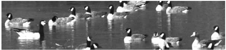
Barnacle Goose with Canada and Cackling Geese and one Greater White-fronted Goose. Lake Bloomington, McLean County. 12 February 2013.

MC: 1570, Mercer, 31 Dec (CDM, JLM, m.ob.); 1116, QC, 16 Dec (KJM, SBH, m.ob.); 586, Fulton & McDonough, 1 Jan (KJM, DJA); 400, CarlL-C, 27 Dec (DMK). Others: Lee & Whiteside (657), 24 Dec (KJM, DJA, m.ob.); Lisle Arb CBC (DuPage Co) (532), 16 Dec (GAW m.ob.); Rock Island (449), 5 Jan (KJM, m.ob.); Carroll & Whiteside (362), 19 Dec (KJM, JLM, m.ob.); LCal (259), 29 Dec (WJM, CDH, MLB); ClintonL (200), 16 Dec (SDB, GSL, RK); Henry (125), 4 Jan (KJM); Kankakee (75), 13 Jan (JBH); Rock Island & Whiteside (74), 20 Dec (KJM, EA, RN).