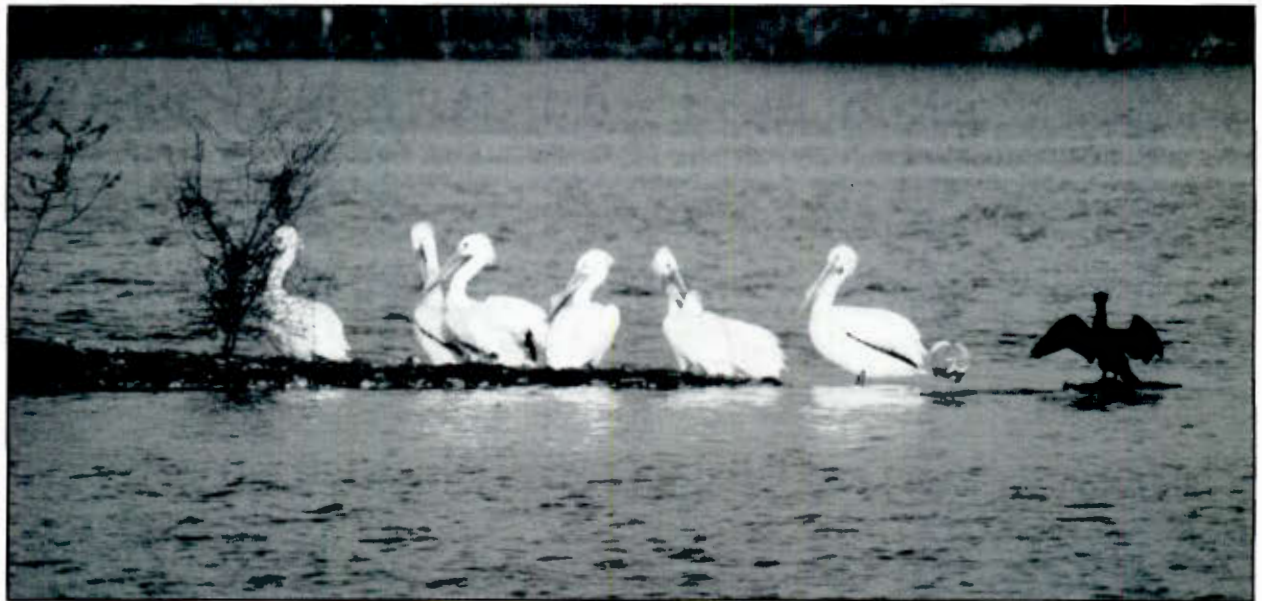
American White Pelicans have been counted on only three statewide spring bird counts, including 1992.