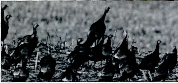
Wild Turkey flock near southeast JoDaviess County. 6 March 2004.