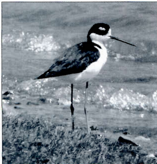
Black-necked Stilt. McLean County. 27 April 2010.

EA: 2 May (21), see below; 5 May, Montrose (DKA); 12 May, LCal (Calumet WTP) (APS, WJM); 13 May (6), Sangamon (HDB); 14 May, HL (KAM); 14 May, Kankakee (JBH); 16 May (2), HennepinL (JAS, MAM). MC: 21, Bellrose Rsv, 2 May (EWW); 8, KLMSNA, 14 May (C&PD). LD: 7 Jun, Marshall (MJB); 31 May, Montrose (BCS); 28 May (2), Kankakee (JBH); 26 May, Montrose (SGS).