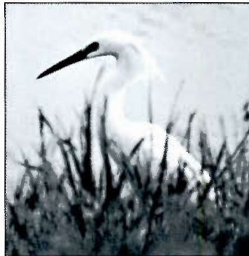
Top: Eared Grebe. Lincoln Park North Pond, Chicago, Cook County. 29 April 2003.