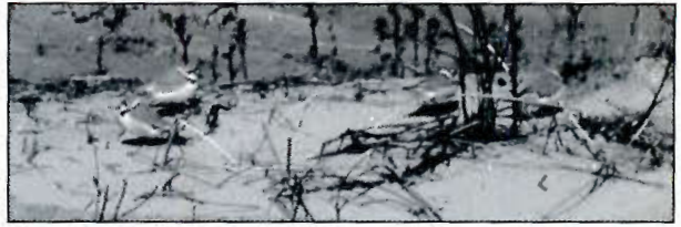
Piping Plovers at Montrose Harbor, Cook County. 2 May 2004. Nine Piping Plovers were seen here at one time.

EA: 12 Mar (22), Boone Co (AB); 16 Mar, JP (PC). MC: 25,060, nw. IL (Spring L (Carroll Co), L&D#13 (Whiteside Co), L&D#14 (Rock Island Co)), 26 Mar (1C)—record spring high count excluding aerial survey data; 12,450, Hennepin L, 6 Apr (DFS); 10,484, Chau, 2 Apr (R&SBj); 2700, HL, 16 Mar (KAM); 800, Carl.C, 4 Apr (DK). LD: 22 May, L&D#13 (Whiteside Co) (EW); 22