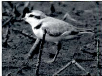
Snowy Plover. Bellrose Refuge, Pulaski County. 9 May 2004.