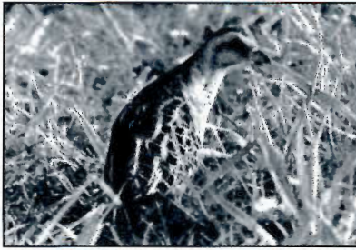
Yellow Rail at Springbrook Prairie, DuPage County. 20 April 2008.