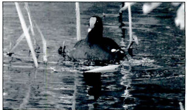
Common Moorhen. Madison County. 18 May 2008.

EA: 12 Mar (19), Teague Hill Rd (Massac Co) (FKB); 20 Mar (85), nw. of New Athens (St. Clair Co) (TJD); 20 Mar (36), American Btms (C&PD); 24 Mar (30+), Richland Co (CLH); 5 Apr (50), Emery Rd & Greenswitch Rd (Macon Co) (TAM, MFD); 5 Apr (95+), se. Edgar Co (EWW). MC: 7780, Young America Twp (Edgar Co), 13 Apr (BO); 3540, Milam Twp (Macon Co), 20 Apr (BO); 2000+, Fayette Co, 6 Apr (KAM); 2000+, se. of Mode (Shelby Co), 4 May (WSS, EWW); 600, Coles Co, 24 Apr (GAW); 119, Harrison (Wbgo Co), 20 Apr (DTW). LD: 2 Jun (2), Madison Co