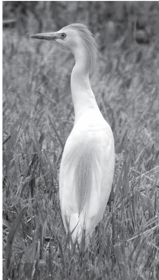
Cattle Egret. Cobden, Union County. 18 May 2013.