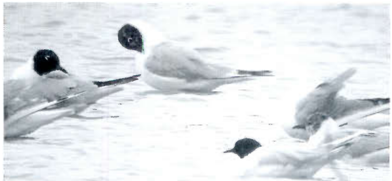
Little Gull, right front swimming in water, with Bonaparte's Gulls. Clinton Lake, DeWitt County. 14 April 2012.

MC: 111, Monroe, 5 May (C&PD); 57, Union, 5 May (SDB); 31, Randolph, 25 Mar (KAM); 29, JP, 15 Apr (PRC); 29, Clinton, 5 May (KAM); 26, WhisperingWillows, 4 Mar (JBH).