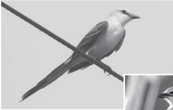
Scissor-tailed Flycatcher. Horseshoe Lake, Alexander County. 19 May 2013.