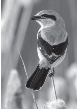
Northern Shrike. Chain O' Lakes State Park, Lake County. 23 March 2013.