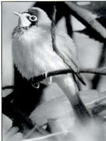
Canada Warbler at Lake Shelbyville, Moultrie County. 21 May 2005.