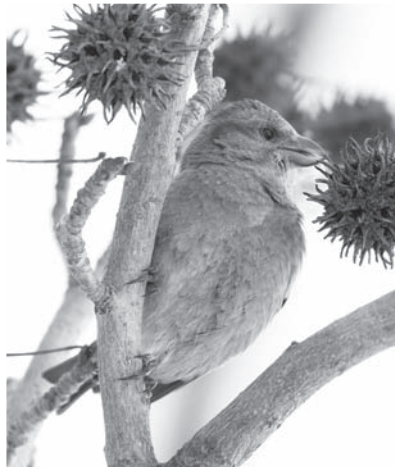
Female Red Crossbill. Eastern Illinois University, McLean County. 2 March 2013.

MC: 20, 2 Jun, Sand Ridge SF (Mason Co) (JAS); 12, Champaign , 14 Apr (SAW); 8, Sand Ridge SF (Mason Co), 23 Mar (AGi); 5, Charleston (Coles Co), 13-14 Mar (TDF); 5, South Shores P, Decatur (Macon Co), 1 Mar (TAM). LD: 2 Jun (see above); 14 Apr (12) (see above); 14 Apr (4), Palos Park (Cook Co) (MC, JC), 7 Apr (5), Busey Woods (Urbana) (MM-L); 7 Apr (5), Woodlawn Cemetery (Urbana) (MM-L). Others: 1 Mar (5), Volo Bog SNA (Lake Co) (SDB); 3 Mar (3), Charleston (Coles Co) (RBR); 14 Mar (4), Jackson (JSu); 21 Mar (2), Oregon (Ogle Co) (DTW); 30 Mar, Spfld (HDB).