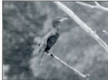
Juvenile Neotropic Cormorant, at Carlye Lake, Clinton County. 30 July 2009. This species was seen on and off between 27 June and July 30 2009.