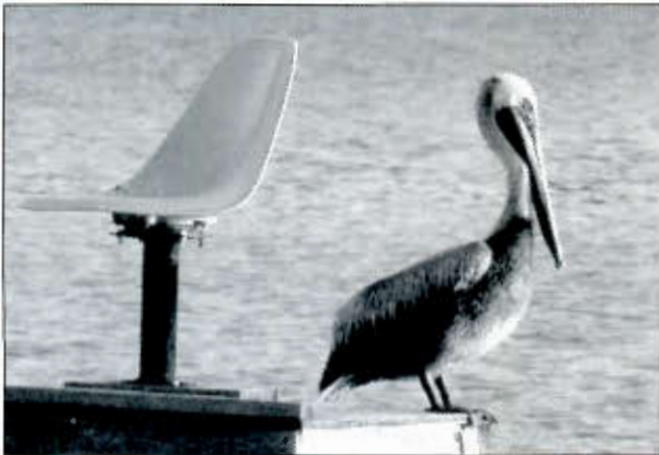
Brown Pelican. Two Rivers National Wildlife Refuge, Calhoun County. 23 July 2009.

Breeding: 1 st Illinois breeding record. 5 pr @ 5 active nests w/4+ juv, 25 Jun -14 Jul, CRSNA (MML ph) w/1-3 birds noted as early as 3 May