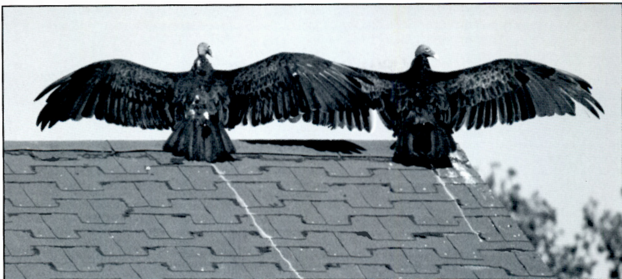
Pair of Turkey Vultures at barn, Grundy County, 28 July 1994.

(Champaign Co) (female), 23 June-3 July+ (RC); Mahomet (Champaign Co) (female), 26 June; Middlefork F.P. (Champaign Co) (2 female or imm.), 16 July (RC); 12 June (female) & 23-25 June (male), Wilmette (EW).