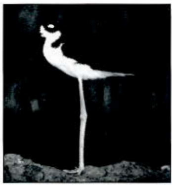
Black-necked Stilt at rice fields at East Cape Girardeau, Alexander County. 17 July 2004.

Breeding: RedwingSl (calling), 26 June (SB); Broberg Marsh (Lake Co) (calling), 22 June (SB); Palos (Buttonbush Slough) (2 territories), 17 June (SB). Others: Motorola Marsh (Lake Co) (pr), June (MW fide SB); Almond Marsh (Lake Co) (ad), 31 May (EW); Palatine (heard), 9 July (AA); MArb, 9 June (ES); Hidden L FP (DuPage Co), 31 July (G); Chau, 14 July (RBj, SBj).