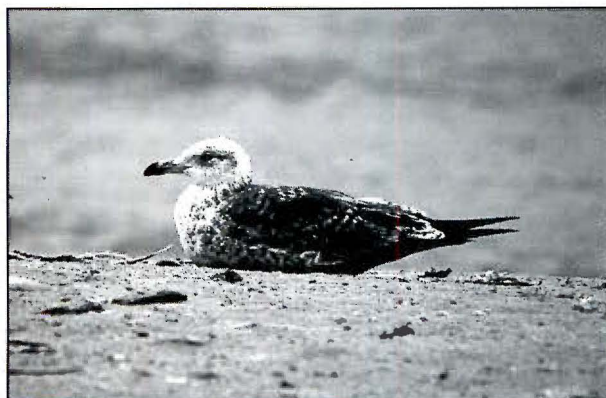
Molting first-summer Lesser Black-backed Gull at Great Lakes Naval Training Center. Lake Co. 19 June 1999.

GrtLakes (subad), 15 Jun, increasing to 15 (11 ad & 4 subad), 9 Jul (EW).