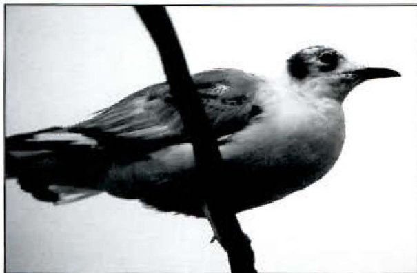
Bonaparte's Gull at Great Lakes Naval Training Center. Lake Co. 19 June 1999. One of up to 83 present in June.

NBSO: MC: 113, GrtLakes, 31 May (EW)—from 60 to 80 (including 1 ad) could be found at GrtLakes thru Jun and early Jul, then reduced to 10 by 22 Jul and zero by Aug (EW).