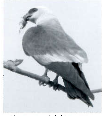
Above, an adult kite captures a cicada (Summer 2011)