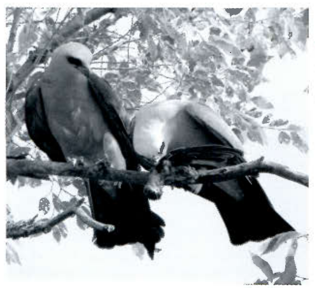
Left, a male eats a Chimney Swift, while the female waits (apparently) in vain for some of the meal. (17 July,)