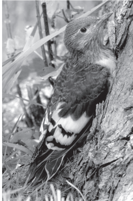
Juvenile Red-headed Woodpecker. Carpentersville Dam, Fox River, Kane County. 31 July 2012.