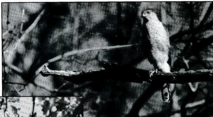
Above: Cooper's Hawk on territory, Washington Park, Sangamon Co. 30 April 1996.