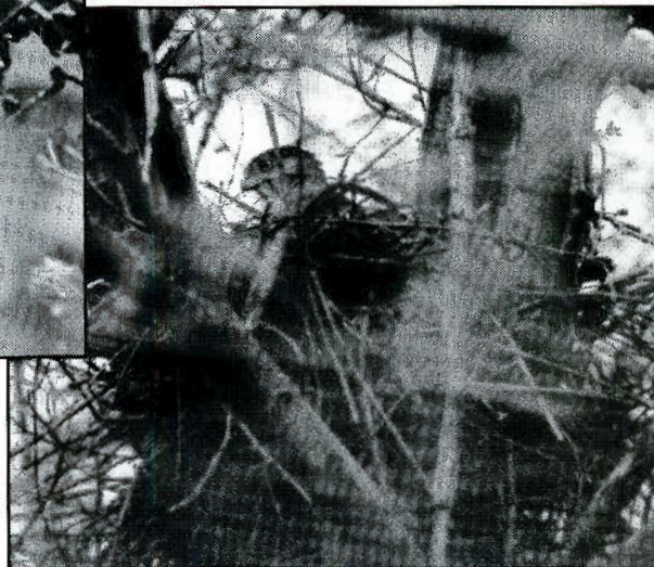
Cooper's Hawk on nest, Washington Park, Sangamon Co. 6 May 1996.