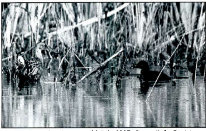
Adult King Rail with young. 10 July 1997. Goose Lake Prairie State Natural Area. Grundy Co.

Nesting: GLPSP (4 = 2 ad. w/ 2 yg.), 6 July (DS) thru 12 July (CMc, JMc); PRSNA (2 broods), June/July (JW, EK). Others: Pecatonica (Winnebago Co) (heard), June/July (DW); Lawrence County wetland, 15 June (LH).