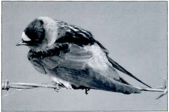
Cliff Swallow at Goose Lake Prairie State Natural Area, Grundy County. 9 June 2009.

(GAW); Jarvis (nesting, w/many juvs), season (LGM); JP (47 incl yg), 12 Aug (PRC) plus 2 nd colony of 11 pr feeding yg, 11 Jul (PAD); Mahomet (Champaign Co) (60+ in 6 nest boxes, on nests), 11 May (JC); New Athens (St. Clair Co) (142 ad + 78 yg at 11 town nest box colonies), 4 Aug (TD); DuQuoin (Perry Co) (10+ @ martin houses downtown), 30 Jun (SDB,SLD). MC: 800 (staging), Harrisonville (Monroe Co), 17 Jul (DMK); 287, Kaskaskial (Randolph Co), 26 Jul (CAT, TLK); 220, see above; 120, CarlL-C, 30-31 Jul (DMK, MSS); 90 (10 ad, 80 juv), Nason, RendL, 8 Aug (TD); 47, see above; 40, RendL, 11 Jul (DMK, MSS); 39, Cuba M FP (Lake Co), 7 Aug (B&B); 39, Montrose, 30 Jul (GAW); 30, Caseyville (St. Clair Co), 5 Jul (DMK); 30, Ware (Union Co), 20 Jun (DMK, MSS). Note: At Lake Arlington, Arlington Heights (Cook Co), "Due to the cold snap on 1-3 Jul, we lost 52 nestlings of various ages after the adults abandoned the houses for 4 days leaving the nestlings to starve." (JCB).