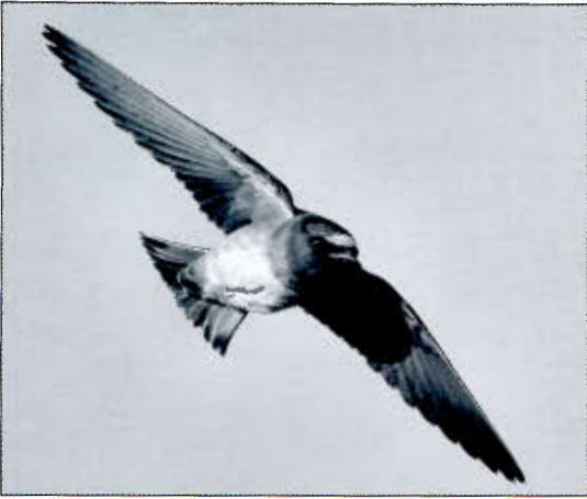
Cliff Swallow at Homer, Champaign County. July 2009.