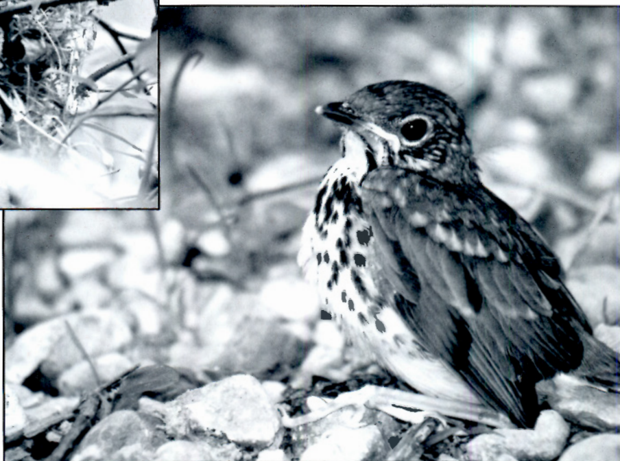
Wood Thrush young seconds after fledging from its nest at Plum Creek Forest Preserve, Cook Co. 16 June 1995.