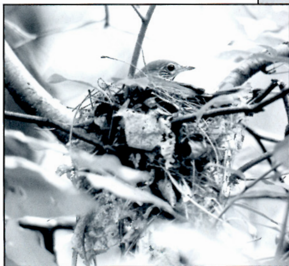
Female Wood Thrush on nest. Will Co. 30 June 1995.

RCSP, (5 June & 3 July (BG); I & M Canal bike path (Cook Co) (2 males), early June (SL); PCFP (3 males), 16 June (EW); Willow Springs (male), 3 June (GWi); three e. Will County F.P.s (11 = 10 males, 1 female), 21 May-1