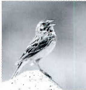
Vesper Sparrow. North Aurora, Kane County.