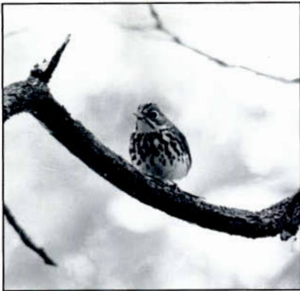
Ovenbird defending fledged cowbird at Kankakee River State Park (Will Co.), 5 June, 1991.

(JM); 8, JP, 10 June (HR); 7, Kinmundy (Marion Co.), 23 June (RC); 7, Spfld, 13 June (DB).