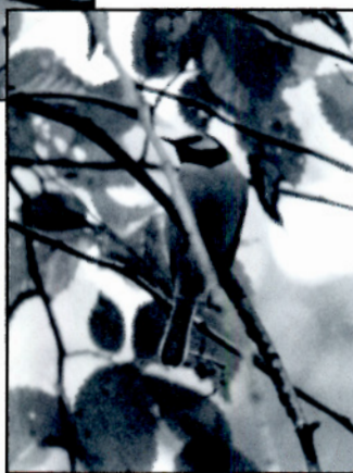
Male Hooded Warbler, Will Co. 16 June 1995.