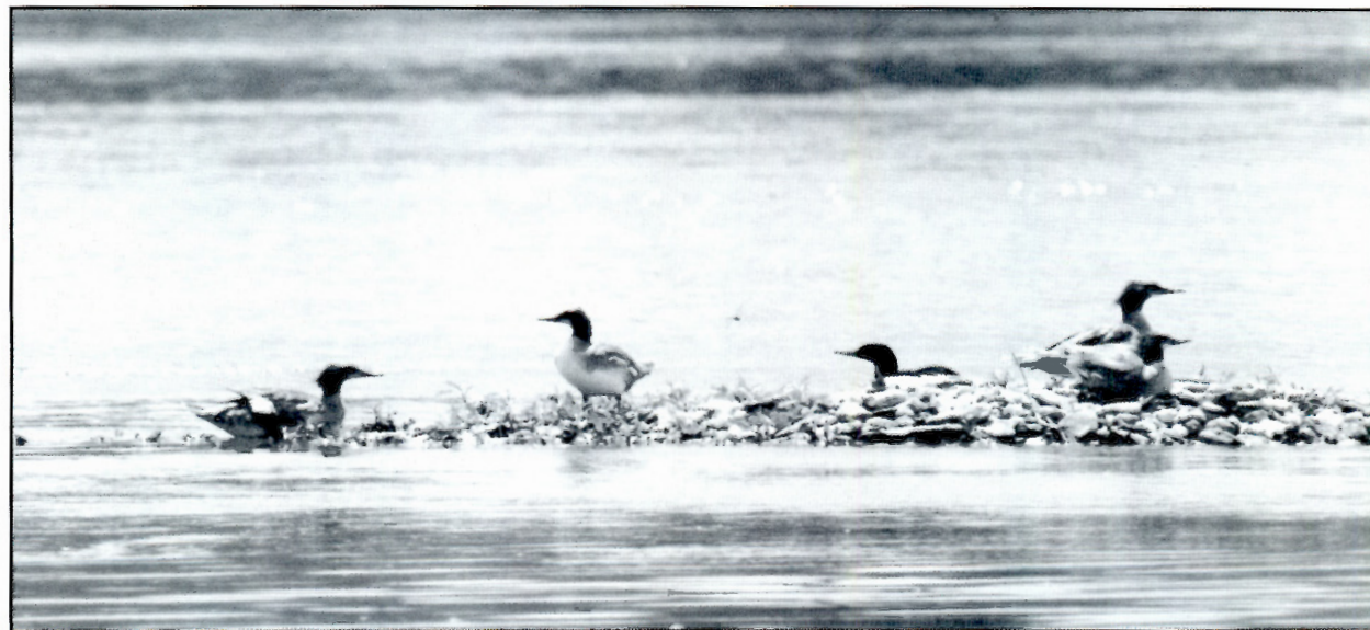
Common Mergansers, one male, four females at Brandon Locks in Joliet, Illinois, Will County, 6 June 1994.