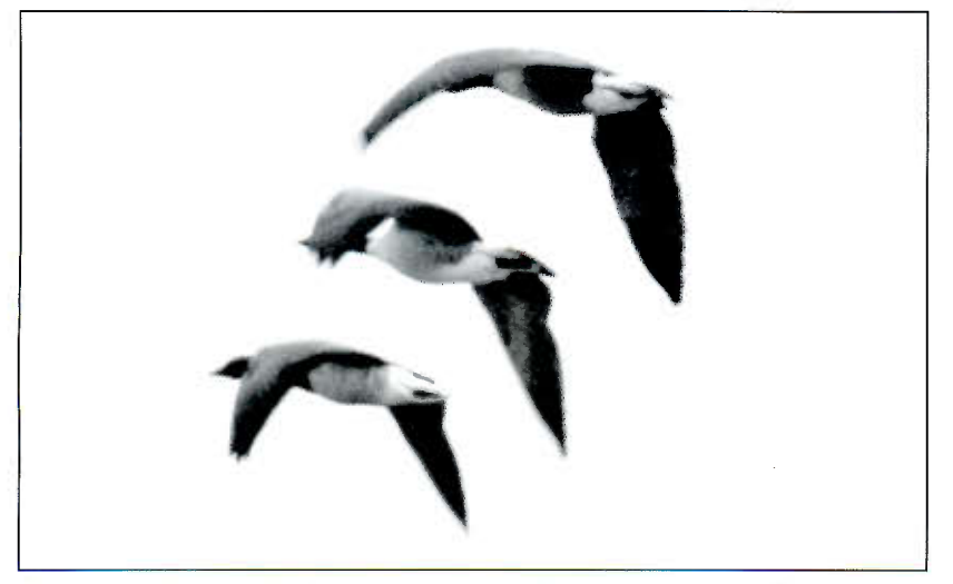
Brant with flock of Cackling Geese. Afton Forest Preserve, DeKalb County. 26 October 2004. Note the dark bib that extends farther down the chest as well as the white throat line.

Zion, Illinois 60099 ericwalters7@comcast.net