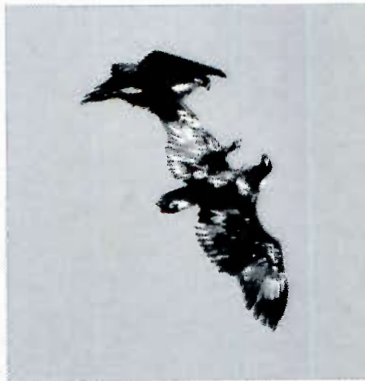
Immature Bald Eagles. 24 October 2011. Forest Glen Preserve, Vermilion County.