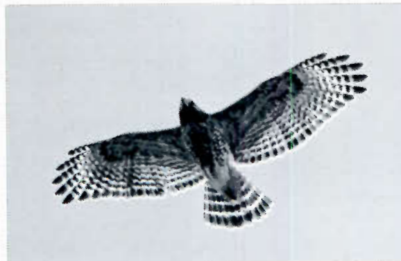
Migrating Red-shouldered Hawk. Forest Glen Preserve, Vermilion County. 24 October 2011.