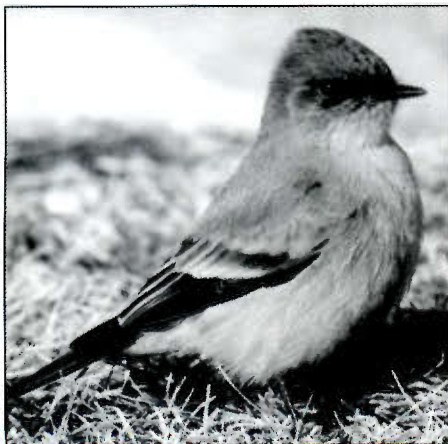
Say's Phoebe at Crane Lake, Mason County. 20 December 2005.