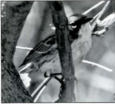
Male Kirtland's Warbler in Wilmette, Cook County. 23 May 2006.