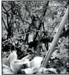
Below: Painted Bunting at Charleston, Coles County. 17 April 2006.