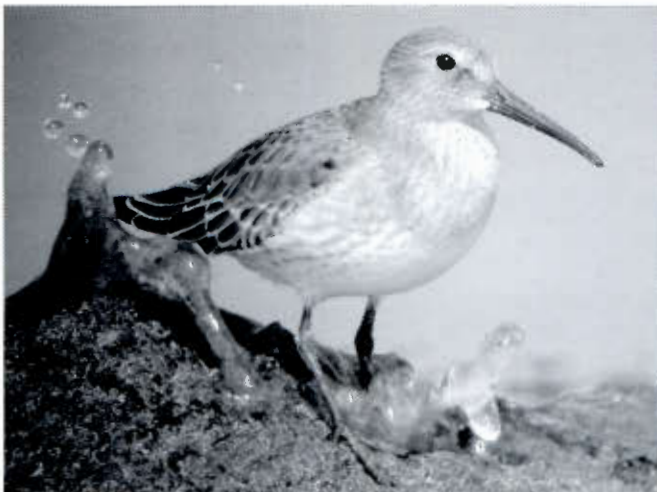
All photos taken in fall 2003 at Montrose Point, Cook County.