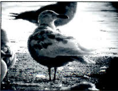
Glaucous-winged Gull. 29 June 2004.