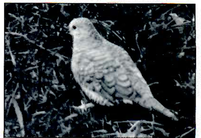
Inca Dove. first state record.