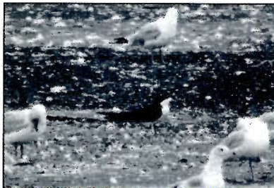
Black Skimmer. Lake Springfield, Sangamon County. 23 July 2004.

One at Carlyle L, CLI on 16-25 Jul (2005.025:DK*). This is the second record for this species in Illinois and the first photographic evidence.