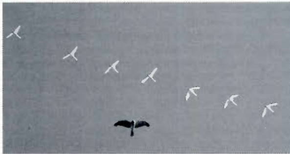
Tundra Swans and Northern Harrier. Illinois Beach State Park, Lake County. 29 October 2010.

MC: 10,000, CarlL-C , 20 & 26 Nov (DMK); 2500, Will , 25 Nov (GAW, CLW).