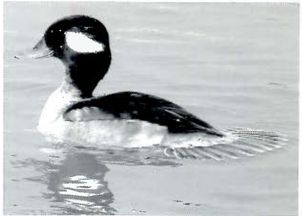
Bufflehead. Montrose, Chicago, Cook County. 12 November 2010.

EA: 30 Oct (4), IBSP (CAT, TLK); 30 Oct (2), WinthropH (JIE, CAT, TLK). MC: 8, Gillson Pk (Cook Co), 20 Nov (JIE).