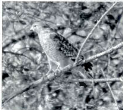
Red-shouldered Hawk. Kennekuk County Park, Vermilion County. 10 November 2010.