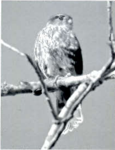
Merlin. Heron County Park, Vermilion County. 10 November 2010.