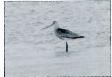
Marbled Godwit at Montrose, Cook County. 23 August 2008.