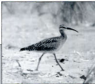
Whimbrel in Lake County. 5 September 2008.

EA: 22 Jul (6), Wauk. (BJS). MC: 60, Montrose H, 5 Sep (RDH); 54, Winthrop H, 5 Sep (EWW). LD: 8 Nov (8), Bailey Wetland (Wayne Co) (CLH); 8 Nov, Carl.C (DMK, MSS).