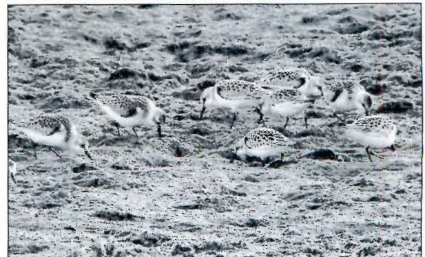
A flock of Sanderlings at Montrose, Cook County. Photo taken 9 September 2008 by Steve Spitzer.