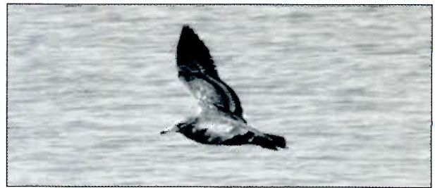
California Gull. Lake Shelbyville, Moultrie County. 15 September 2009.