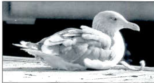
Lesser Black-backed Gull. North Point Marina, Lake County. 13 November 2009.