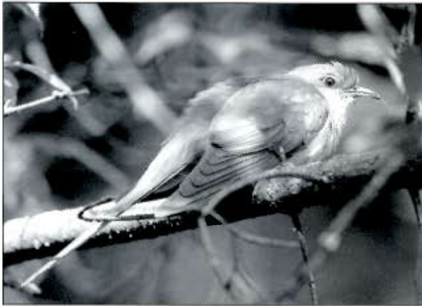
Black-billed Cuckoo. Palos Preserves, Cook County. 4 September 2009.

(EWW). MC: 130, CarlL-C, 13 Sep (DMK, MSS). LD: 31 Oct (6), CarlL-C (DMK).