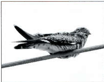
Common Nighthawk. Race and Windsor Streets, Urbana, Champaign County. 26 August 2009.

MC: 250, Wasco (Kane Co), 6 Sep (JAS); 150, Quincy (Adams Co), 26 Aug (AGD); 130, HL, 5 Sep (FRH). LD: 21 Oct, HL (FRH); 21 Oct (10), Kankakee (JHH); 20 Oct, GreeneVal (JAS); 19 Oct, Fairview Heights (St. Clair Co) (TJD).